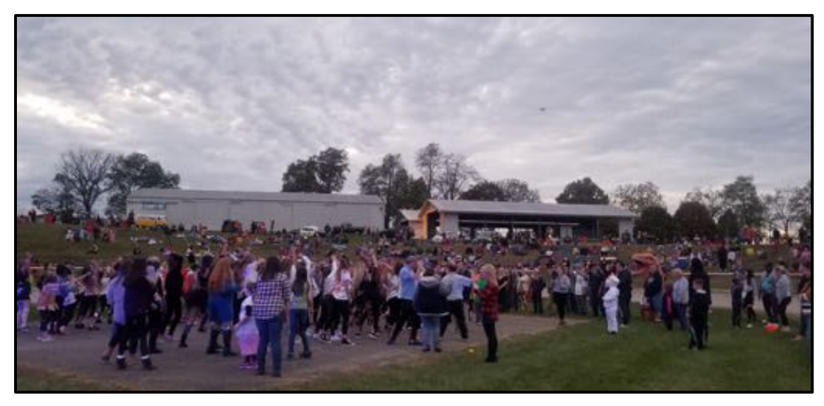
Thriller Dance re-enactment during Family Movie Night at Lakeview Park

Playing "Operation" during Family Movie Night! The game was fabricated by students at Franklin County Career and Technical Center.